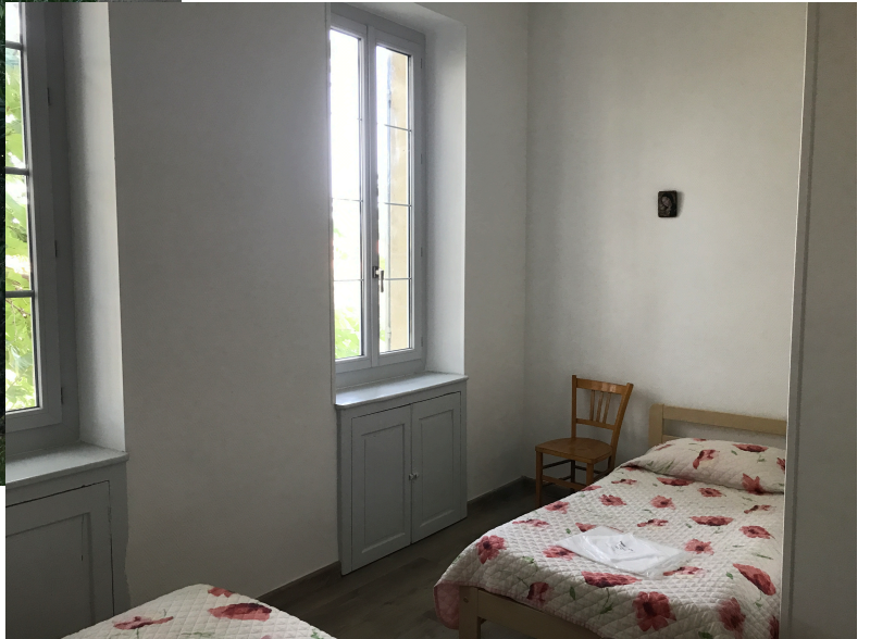
The accommodation is basic, but pleasant.