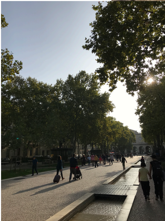
The centre of Nimes is a short (but very hot!!) walk, and is charming.