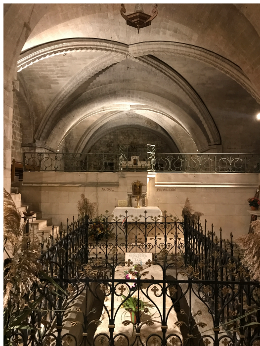
The tomb of the Saint in the crypt of the Abbatial Church